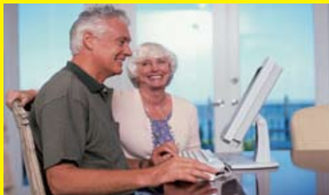
Computer & Internet Tuition