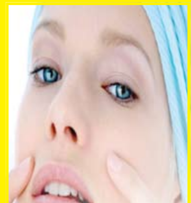
Information & advice on Cosmetic Procedures