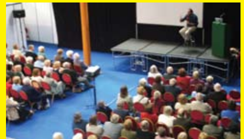
Varied programme of Presentations